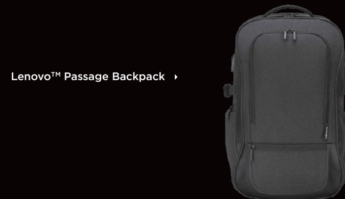
Lenovo™ Passage Backpack ▶