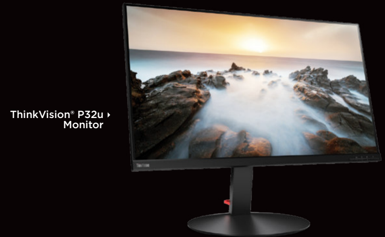
ThinkVision® P32u ▶ Monitor