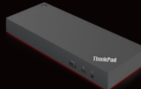
◀ ThinkPad® Thunderbolt™ Workstation Dock