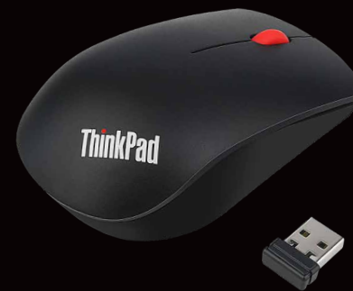
◀ ThinkPad Essential Wireless Mouse