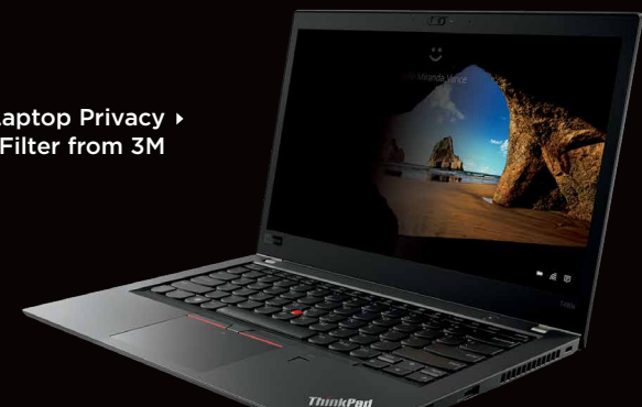
Lenovo Laptop Privacy ▶ Filter from 3M