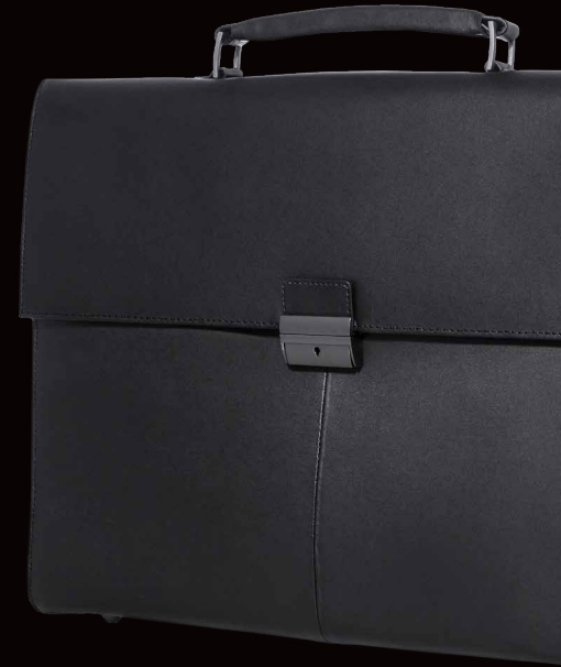
Lenovo Professional ▶ Topload Case